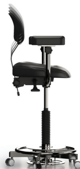
Backrest Height Adjustment