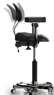
Backrest Tilt Adjustment