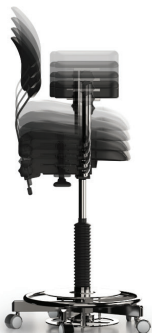
Seat Height Adjustment