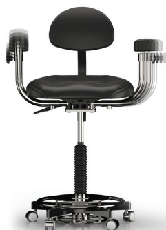
Armrest Height and Width Adjustment