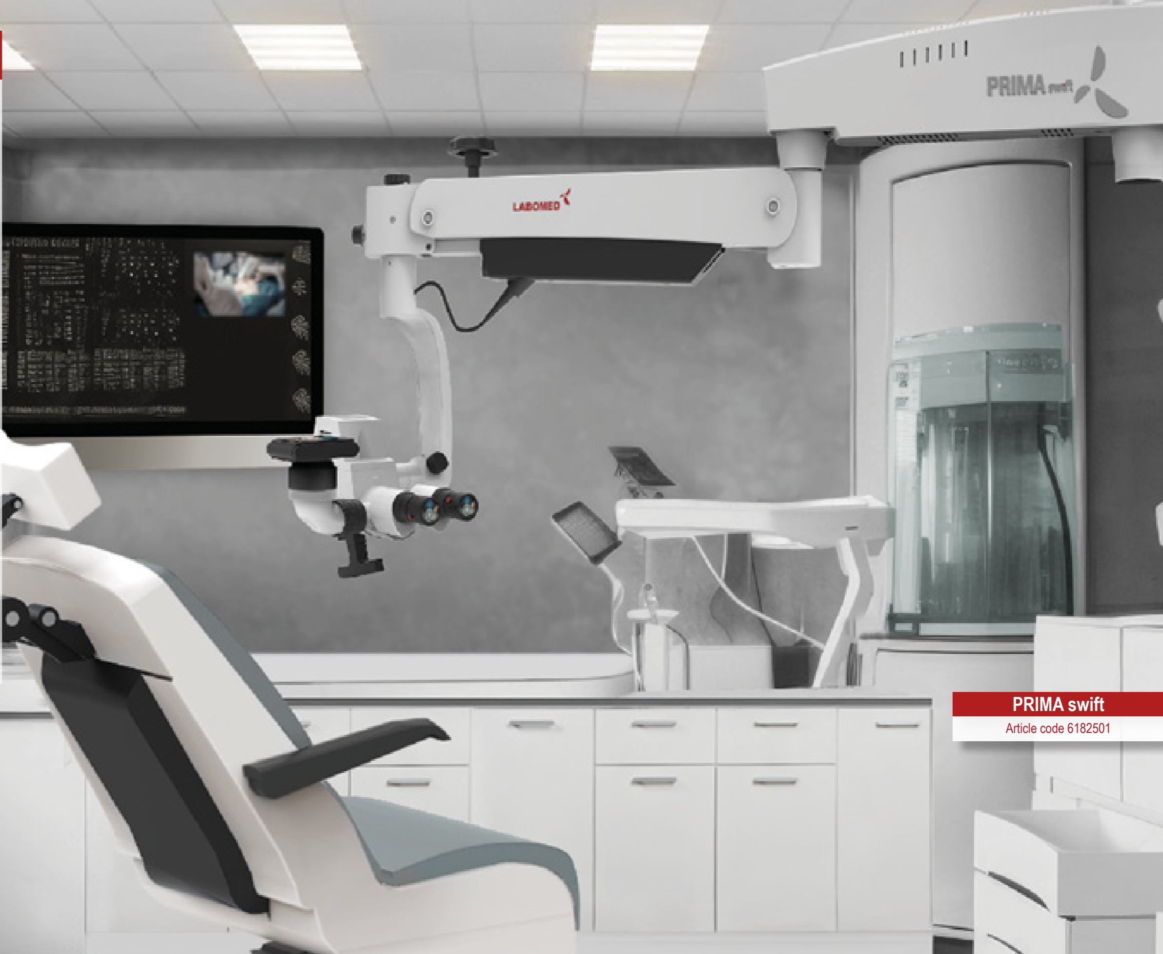
PRIMA swift Article code 6182501

Experience enhanced depth of field and contrast for detailed observations, making it an essential tool for specialists in the field.