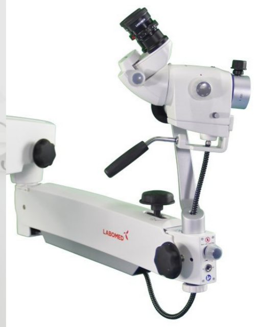
PRIMA GN, 45° HEAD Article code 6165000-110

Labomed Prima GN microscope is also available in two other different versions: 45° head & Ergo head