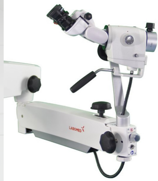
PRIMA GN, ERGO HEAD Article code 6165000-125