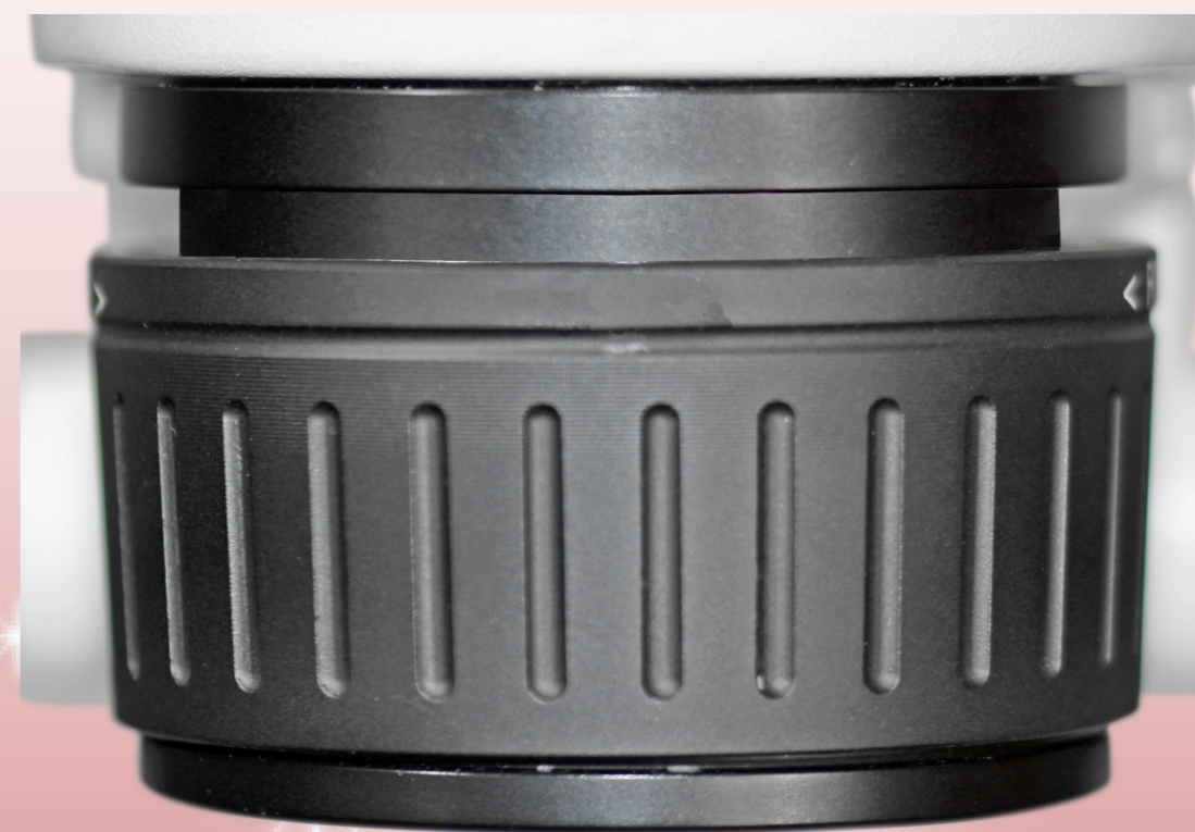
CMO 300 Article code 6183300