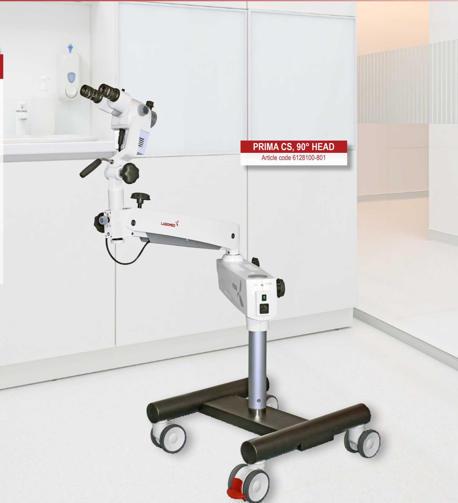
PRIMA CS, 90° HEAD

The arm can easily be mounted directly on an exam chair.