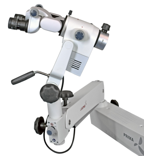
PRIMA CS, ERGO HEAD