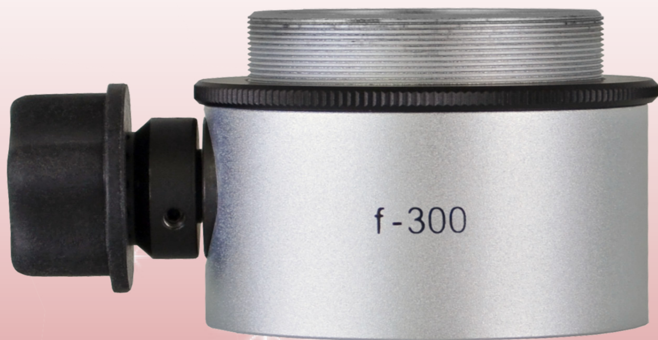
CMO 300 Article code 6133300-801