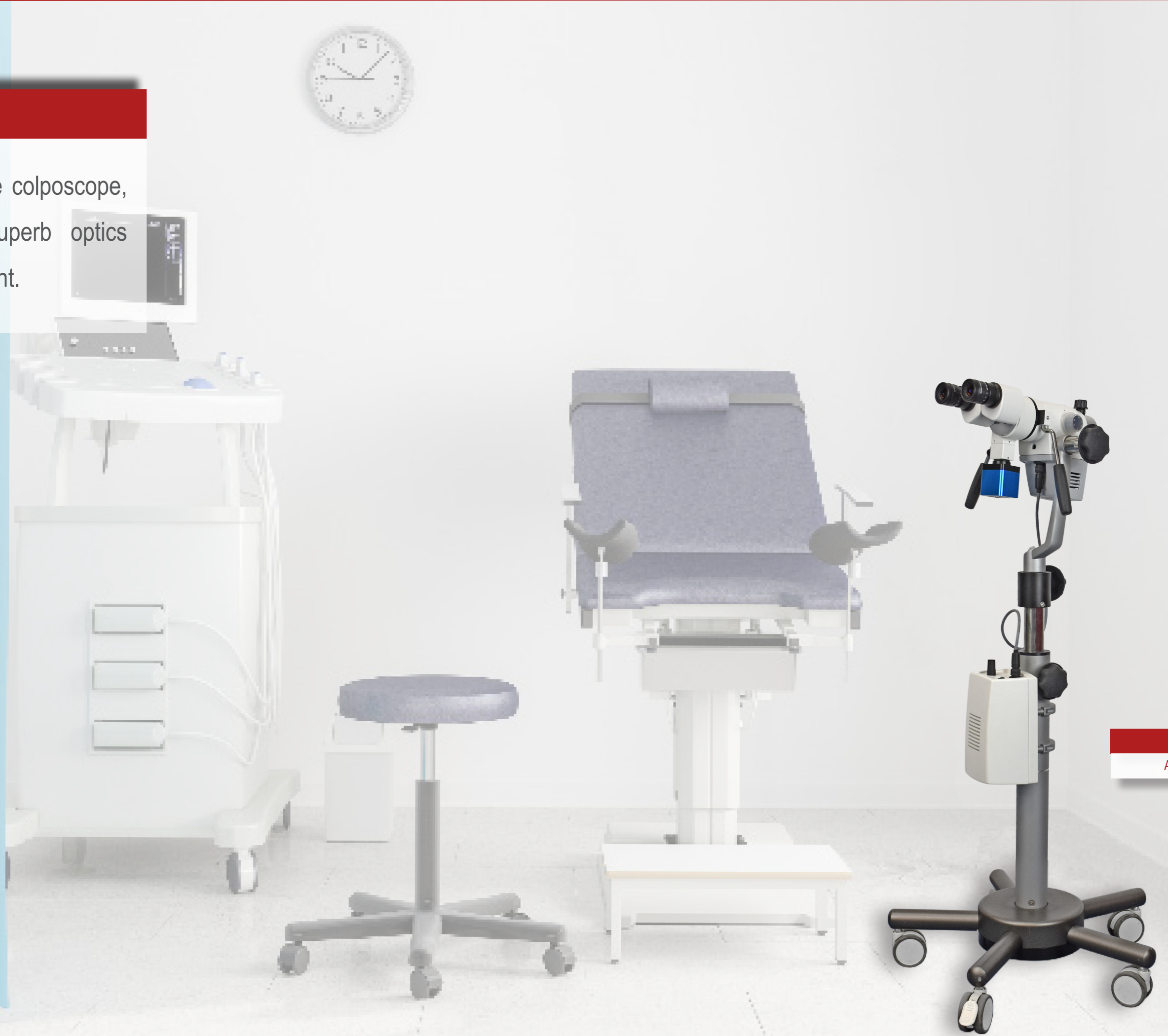
PRIMA C Article code 6128000

Compact and versatile colposcope, high power LED, superb optics and ergonomic footprint.