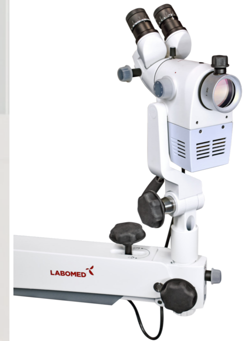
PRIMA CS, 45° HEAD