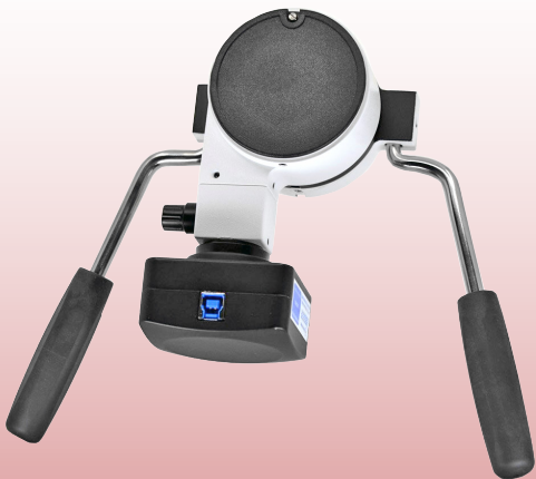
Single Beam Splitter GN version with camera