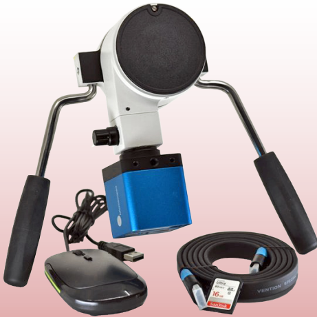
Single Beam Splitter GN version with HDMI camera