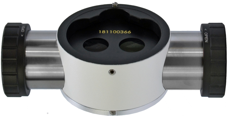
Single Beam Splitter GN