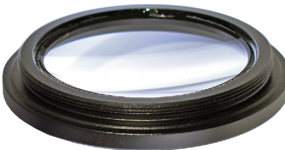
NuVar lens protector 20 Article code 6133351-812