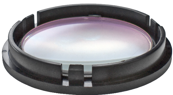
NuVar lens protector 7 & 10 Article code 6156250-801

Protect NuVar 7, 10 and 20 against splashes, dust and scratches (with a lens protector).