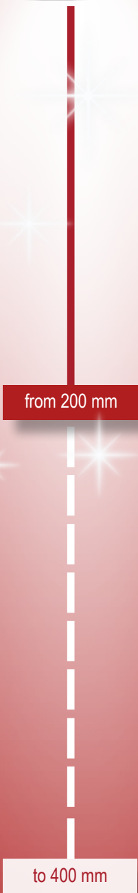
NuVar 20 Article code 6133351

These objectives provide fluid adjustment of the working distance over several centimeters.