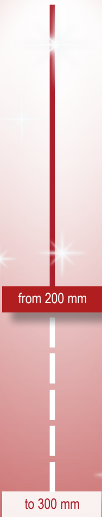
NuVar 10 Article code 6133401