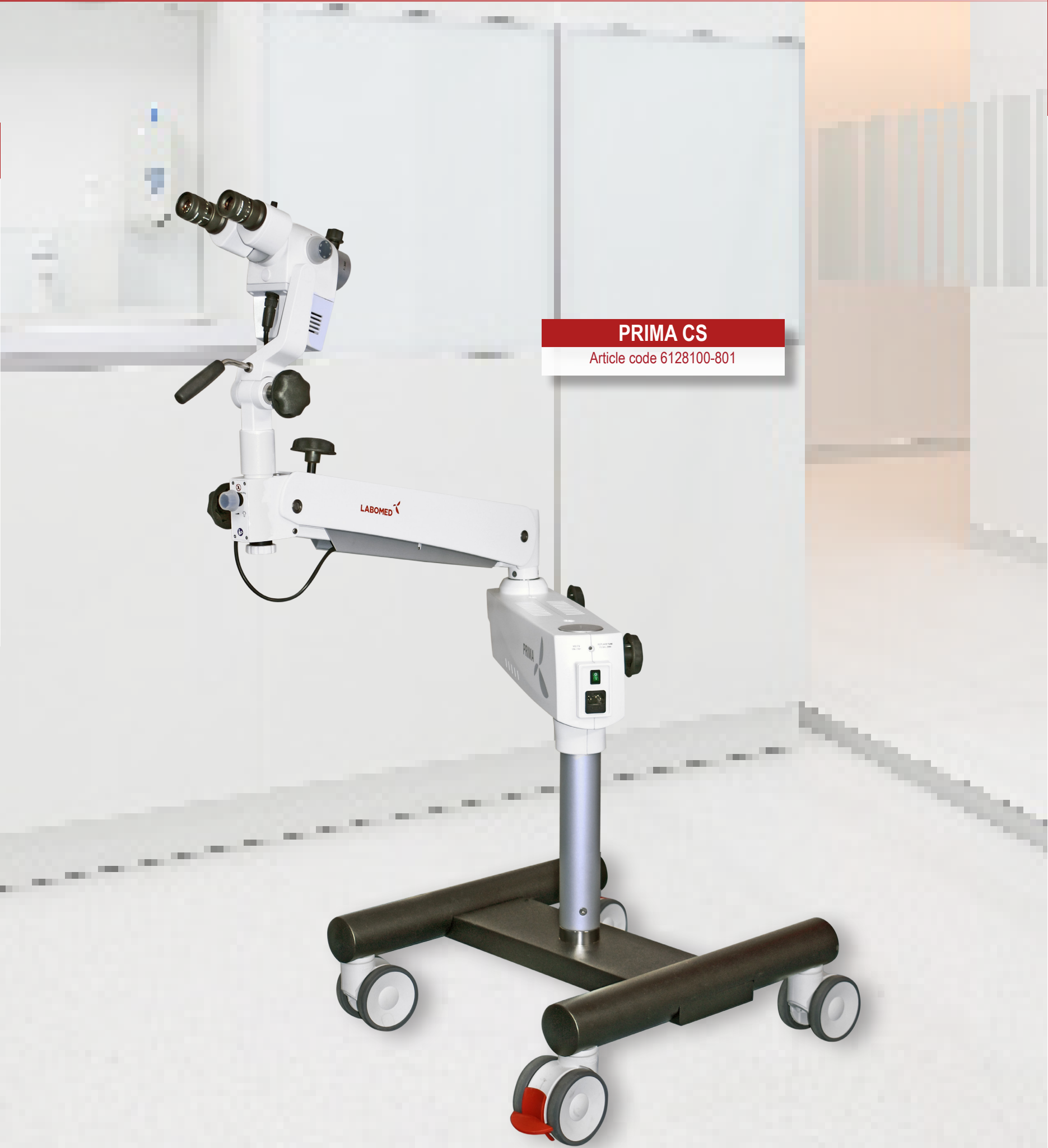
PRIMA CS Article code 6128100-801

The arm can easily be mounted directly on an exam chair.