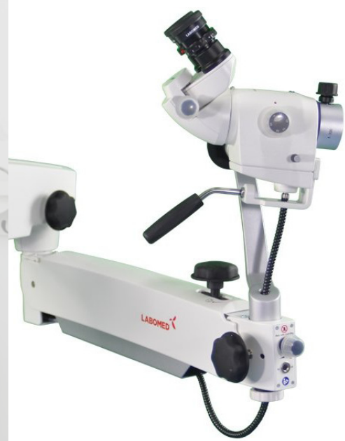
PRIMA GN, 45° HEAD Article code 6165000-110

Labomed Prima GN microscope is also available in two other different versions: 45° head & Ergo head