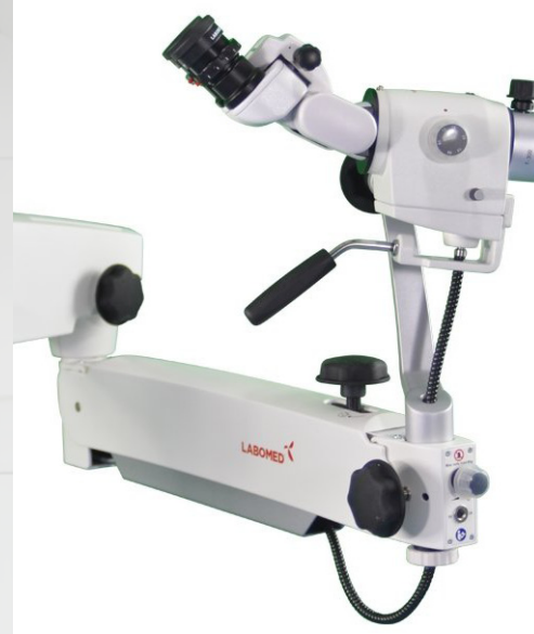
PRIMA GN, ERGO HEAD Article code 6165000-125