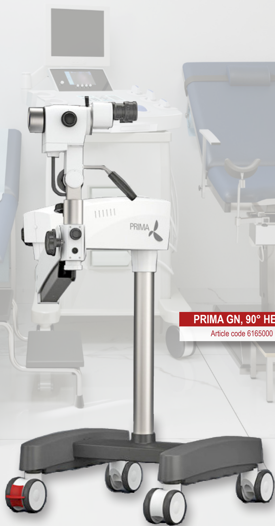
PRIMA GN, 90° HEAD Article code 6165000

A powerful LED light source in combination with a superb optical system makes the Prima GN a valuable partner for diagnostic and surgical work.