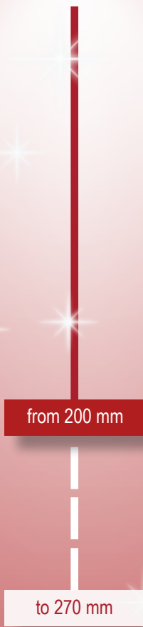
NuVar 7 Article code 613340