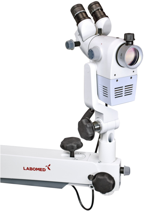
PRIMA CS, 45° HEAD Article code 6128100-803

Labomed Prima CS microscope is also available in two other different versions: 45° head & Ergo head