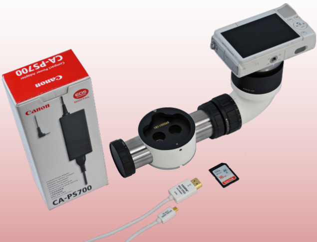
Double beam Splitter, flat, kit incl. M200

If you cannot find what you're looking for, do not hesitate and ask us directly.