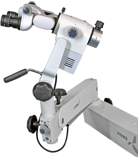
PRIMA CS, ERGO HEAD Article code 6128100-805